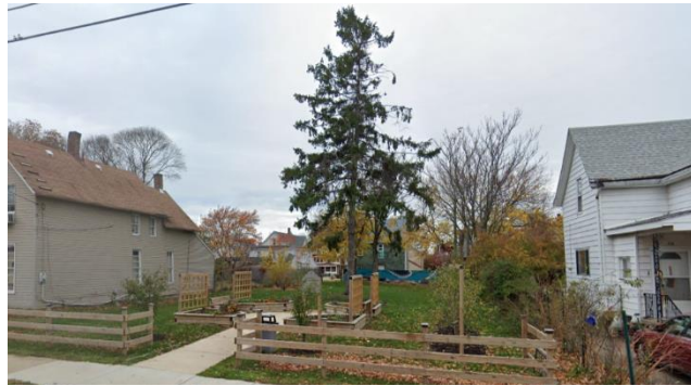
View from East 7th Street looking north